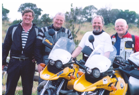
41 Bikers in South Africa