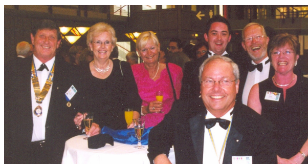
Happy Danes and others in Germany