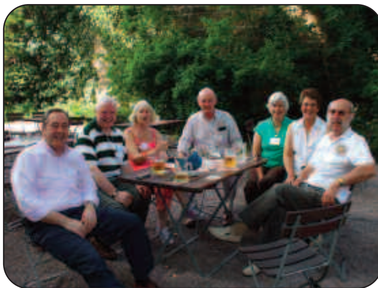
'Conference' at www.41club.org .