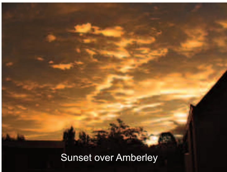
Sunset over Amberley

Round Table and having achieved the magical 41 were relieved to be able to rest and recuperate. Our wives/partners join with us on most activities as they are the ones who have made it possible for the work we were able to