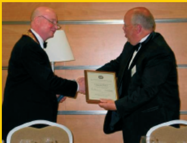
Charter May 2006